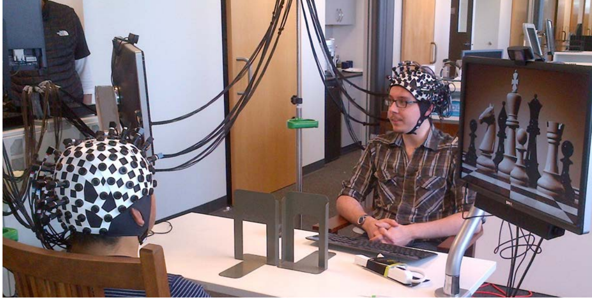
Interactive two-person neuroimaging setup at Joy Hirsch's fNIRS hyperscanning lab at Yale University, USA. The purpose of the fNIRS setup is to understand the neural mechanisms that detect, encode and transmit "natural" social cues.

Hirsch Brain Function Laboratory, Yale University