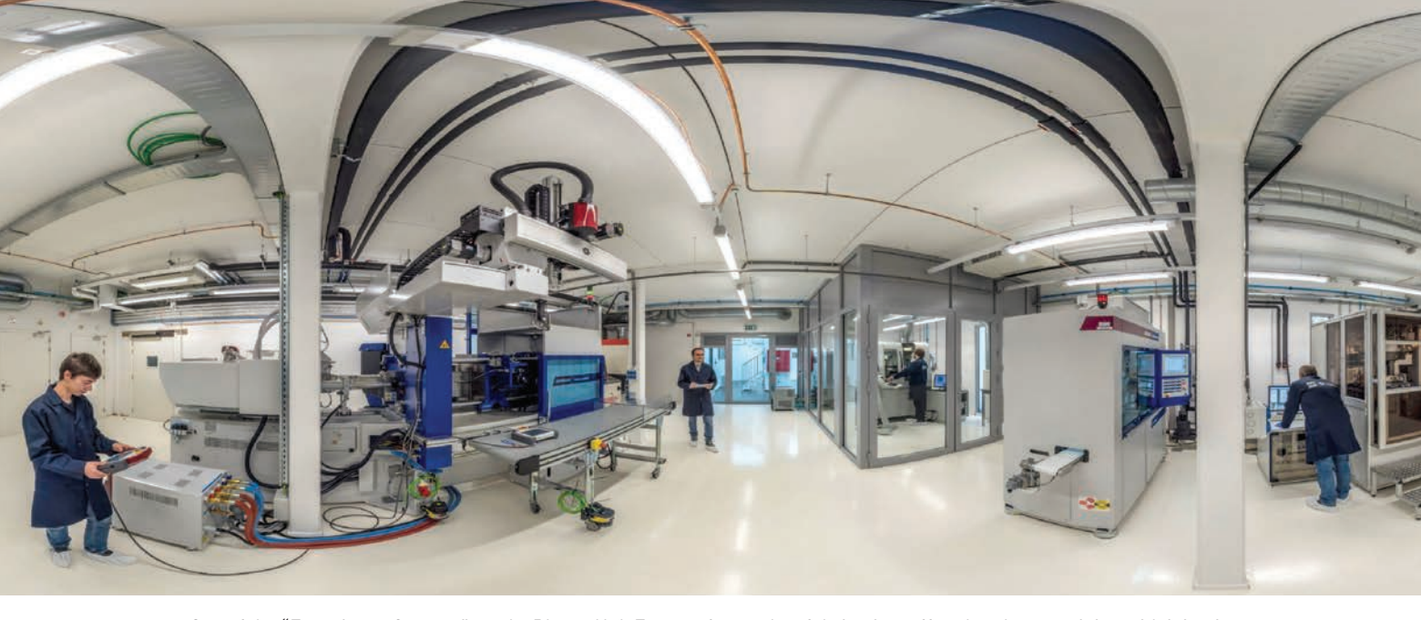
One of the "Experience Centers" run by PhotonHub Europe, focused on fabrication, offers hands-on training with injection and glass-press molding, diamond tooling and hot-embossing equipment.

just Scotland, it's not just the UK, it's not just Europe it's a worldwide thing at the moment."