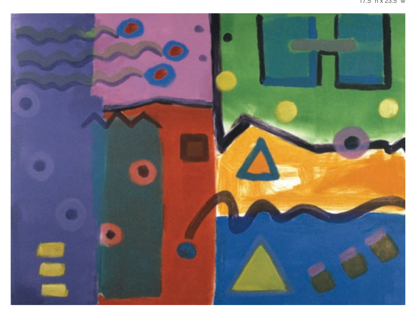
Spectra Series, VIII Carolyn Ellingson, 1993 Monotype 17.5" h x 23.5" w

Carolyn Ellingson, 2000 Monotype with painting 23" h x 34" w