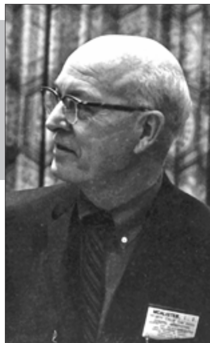
OSA Historical Archives