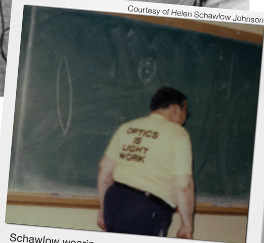
Schawlow wearing an "Optics Is Light Work" T-shirt at Stanford. The slogan was one of several from an OSA competition.

On weekends Schawlow got together with his brother-in-law to finish writing