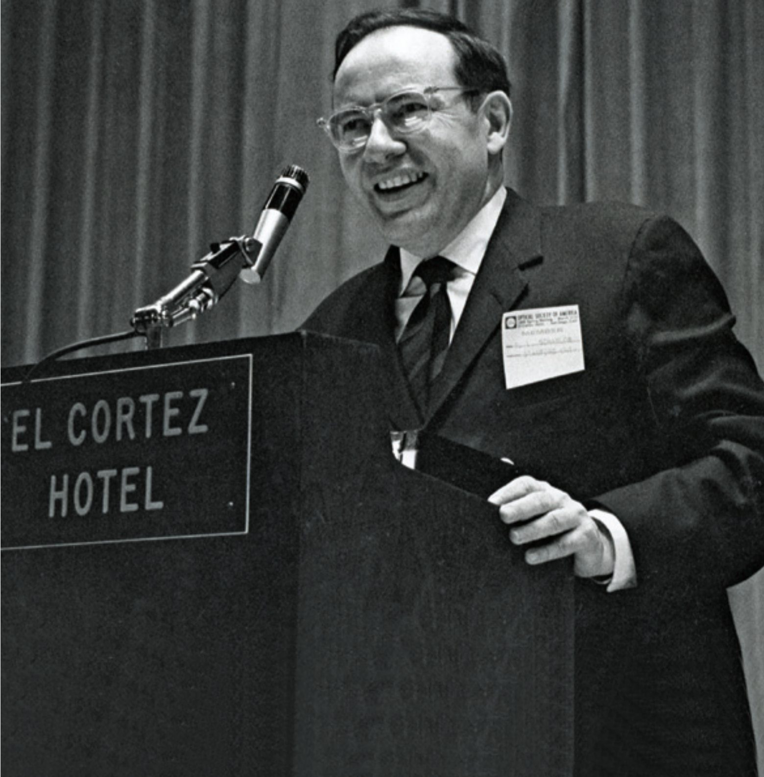
Arthur Schawlow at an OSA meeting.