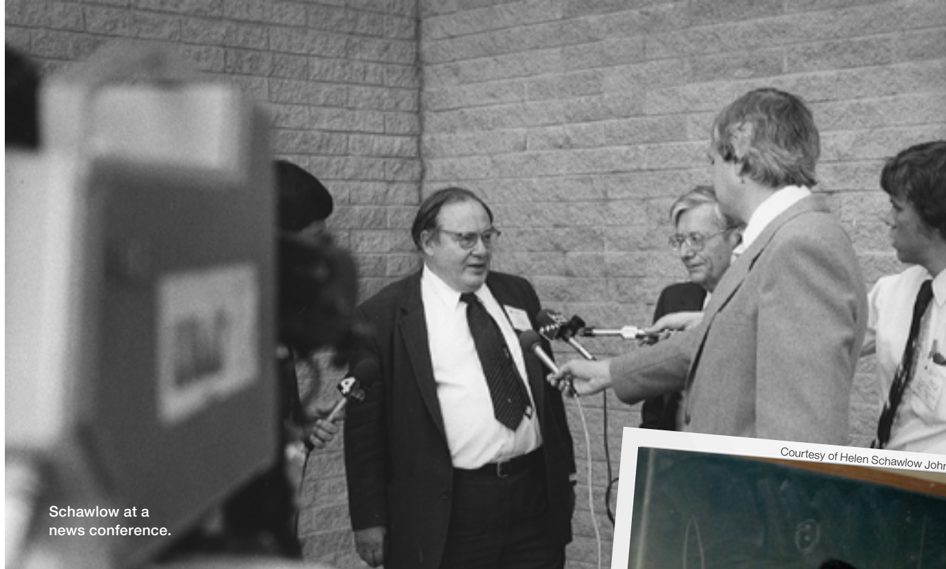
Schawlow at a news conference.